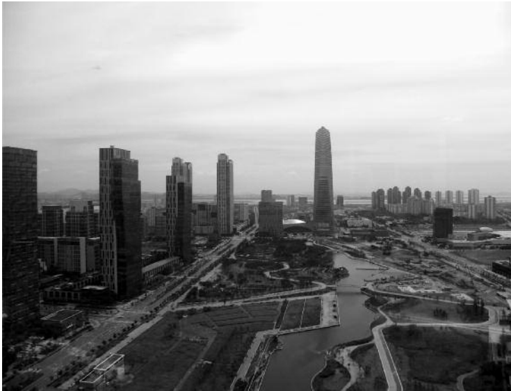
Songdo, South Korea, 2014. Photo: Orit Halpern.

jurisdiction with the data of users in other jurisdictions. This logic of abstraction is more fully exemplified by the emergence of so-called smart cities. An organizing principle of the smart city is that civic governance and public taxation will be driven, and perhaps replaced, by automated and ubiquitous data collection. This ideal of a “sensorial” city that serves as a conduit for data gathering and circulation is a primary fantasy enabling smart cities, grids, and networks. Consider, for example, a prototype “greenfield” (i.e., from scratch) smart city development, such as Songdo in South Korea. This smart city is designed with a massive sensor infrastructure for collecting traffic, environmental, and closed-circuit television (CCTV) data and includes individual smart homes (apartments) with multiple monitors and touch screens for temperature control, entertainment, lighting, and cooking functions. The city’s developers also hope these living spaces will eventually monitor multiple health conditions through home testing. Implementing this business plan, how-