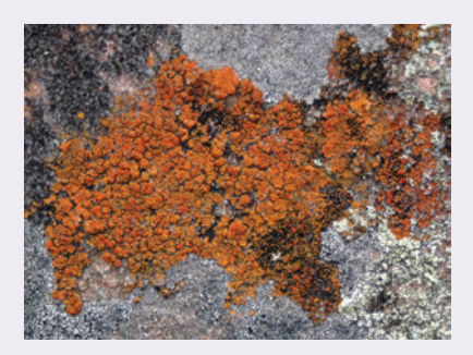
FIGURE B1-2A Lichens grow extremely slowly and remain dormant for months; almost no sign of life can be detected during their dormant period.

Although these various features are always present in living creatures, no one characteristic is sufficient to be certain that something is living versus inanimate. We have no difficulty being certain that rivers, fire, and crystals are not living, but when we search for life on other planets or even in some exotic habitats here on Earth, deciding whether we have actually discovered life might be quite problematical.