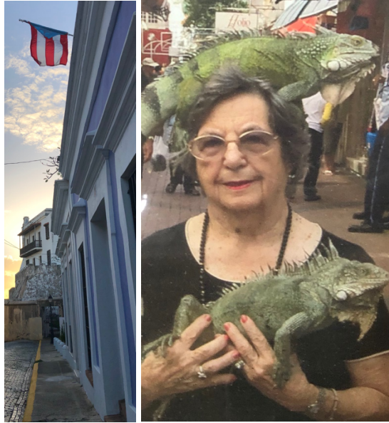
A Changing Puerto Rican Landscape & People: Visual Photo Art Shared at 100% Conference for Motivating People-, Nature-, & Infrastructure-Based Solutions for 2100 and Beyond