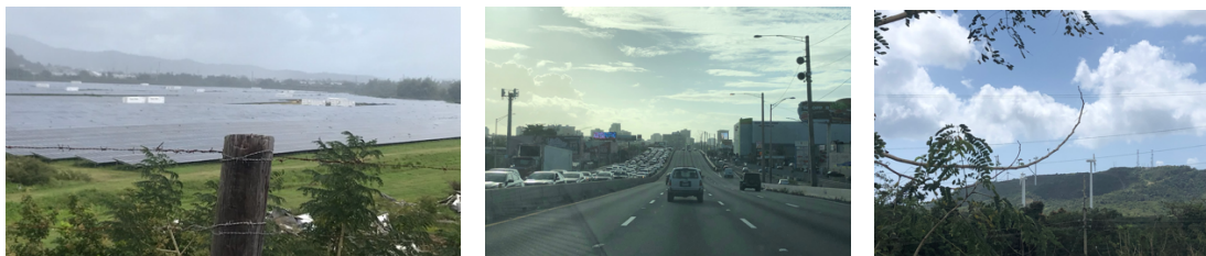
Figure X. Looking Back on 2020: Initial Solar fields, New Decisions towards less Transportation Infrastructure for Moving Vehicles Rather than People, and Wind Turbines in the Mountains

There was a time earlier this century when modern medicine changed more slowly yet the promises of technology have now gone a long way towards enabling longer, healthier and productive living – an appreciation for natural capital over financial capital has resulted in less massive inequality and innovation/entrepreneurship led by Puerto Rico to solve some of the island and world's most pressing issues, has led to a unique respect and global connectedness for Puerto Ricans. We are now living in much more fortunate times —following the tumultuous decades behind us—the balance of power has now shifted from corporations to the people and structural incentives now favor degrowth, circular economies, shared economies, and caring economies. With our economy founded on valuation of natural capital, wealth is created when ecoregions, habitats, and the atmosphere are restored, and it is lost when they are damaged. The rewards of new energy and mobility technology and services to rapidly reimagining eco-resilient infrastructure for and with people and communities, has moved the island to a place of scarcity to abundance. An almost obsessive interest in continuous innovation with increasingly beneficial, high-occupancy, high-utilization, active travel with integrated mobility services by land, air and sea, that embraces automation, connectivity, electrification and shared mobility is a vision of inclusive mobility and energy productivity for mobility that's now shared by everyone.