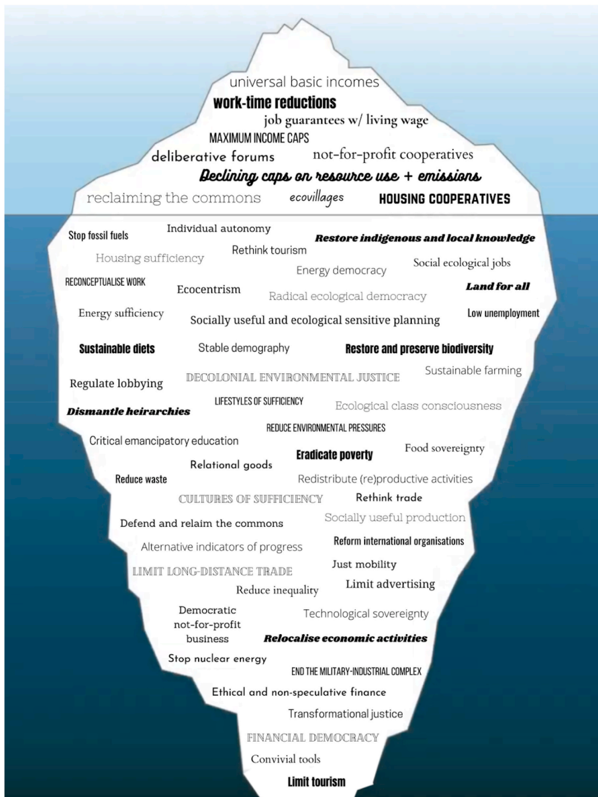
Fig. 3. Iceberg model of degrowth policy proposals - core instruments on top (in descending order of citation frequency), themed goals below (random position). See the full list with sources in Appendix A .

more democratic entities. The second promotes (2) ethical and non-speculative finance , activities like local and regional currencies, time banks, reciprocity networks and trading systems, self-managed credit unions, cooperative banks, public debt-free money, divestment, and corresponding ethical investments.